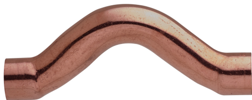
Scavalcamento lungo femmina.